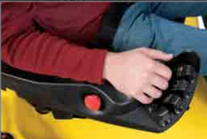
Electro-Hydraulic Controls with TouchPoint Mini-Levers