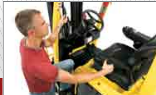
3-Point Entry Design