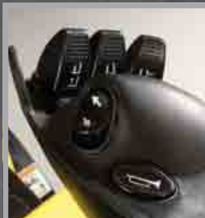
Seat Side Directional Control