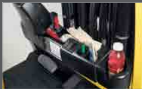
Operator Convenience Station