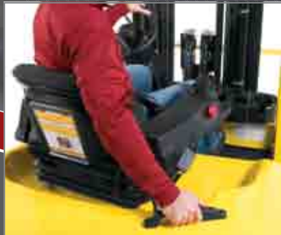
Rear Drive Handle