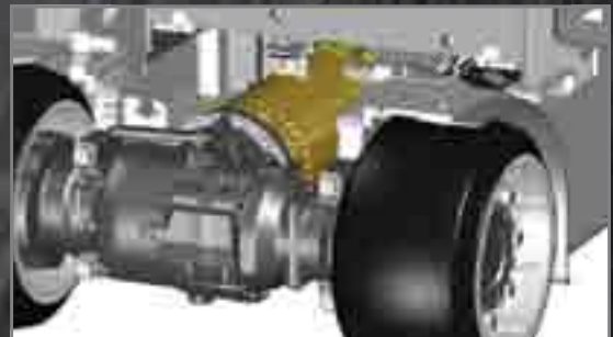
AC Traction Motor