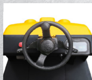
Ergonomic Operator Compartment