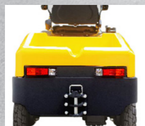
Easy Service Access via Back Cover