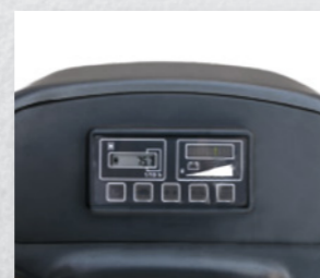
Informative LCD Dash Display