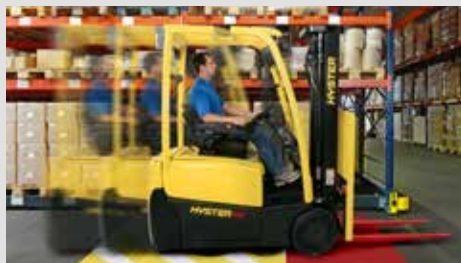
AUTOMATIC SLOWDOWN when approaching the end of an aisle or intersection