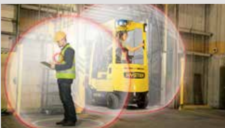
LINE OF SIGHT SUPPORT to help support operator and pedestrian awareness