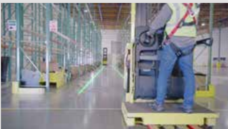
EXCEPTION ZONES in wire guided aisles to continue productivity