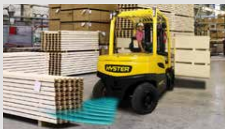
COLLISION AVOIDANCE ASSIST by noticeably reducing the travel speed when obstacles are detected