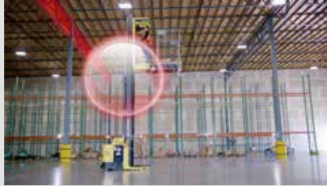
LOCATION-BASED FORK HEIGHT RESTRICTION to avoid low-hanging beams or other obstacles