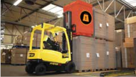
OVERLOAD ARREST to prevent lifting and carrying loads that exceed weight limits

Hyster Reaction proactively adjusts lift truck performance based on real-time conditions, dynamically adapting speed and fork control to maintain the combined stability of the lift truck and load. It continuously monitors the combined center of gravity of the lift truck and load it carries to apply carefully measured performance adjustments to avoid abrupt shifts or jerks that can upset stability, while keeping the operator in control of the lift truck.