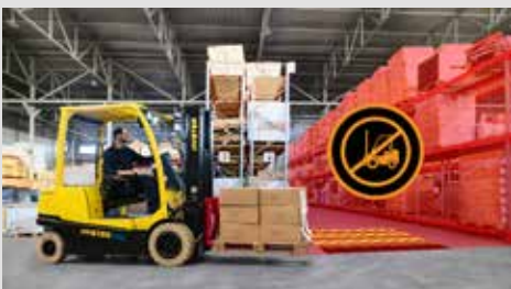
EXCLUSION ZONES to prevent equipment from entering designated areas