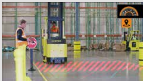
SPEED CONTROL ZONES help reduce travel speed within designated areas in the facility