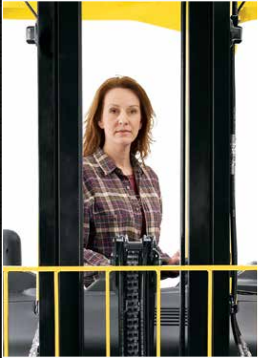
Up to 40% more visibility through the mast than leading competitors.