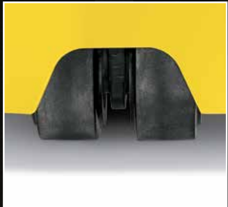
Three-wheel configuration provides a tighter turning radius.