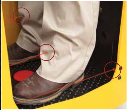
Hyster® Operator Sensing System trains operators to maintain proper operating position.