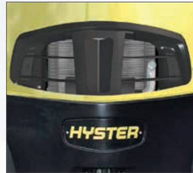
Counterweight tunnel design