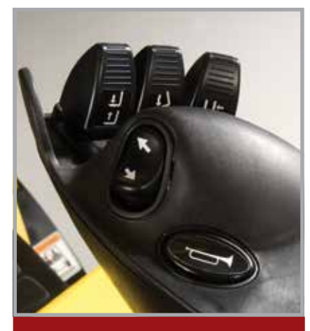
Seatside Directional Control