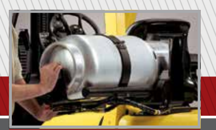
LPG Swing-Out Bracket