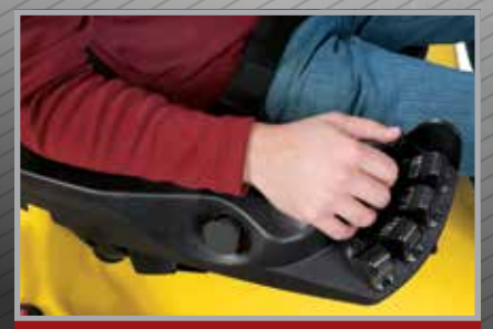
Electro-Hydraulic Controls with Touchpoint Mini-Levers