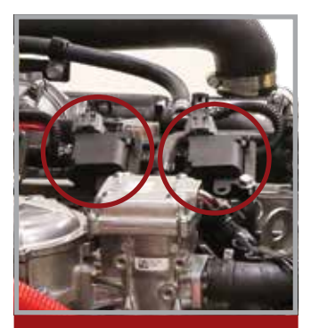
Coil over plug ignition design