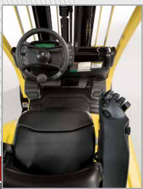
Comfortable Operator Compartment