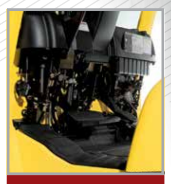
Easy service access