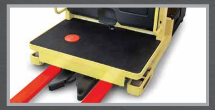
The pallet clamp automatically centers and grips the pallet to allow fast, easy order picking. The foot-operated pedal is easily actuated for quick pallet release. For special pallet handling, we offer a pallet grab with an opening from .5" to 6".

Our reliable Wire Guidance System securely grips the wire for worry-free steering, so operators can focus on the pick task at hand.