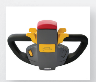
One Sided (Cold Store)