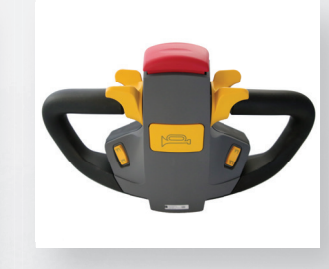
Two Sided (Cold Store)