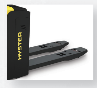
Entry Roller for Easy Operation