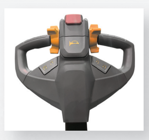
Handle (Standard) (Left & Right Handed)