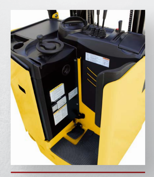
Ergonomic Operator Compartment & Intuitive Controls