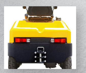
Easy Service Access