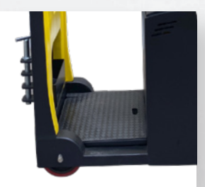
Spacious. Non-Slip Floor Plate