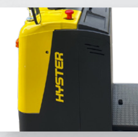
via Front Cover