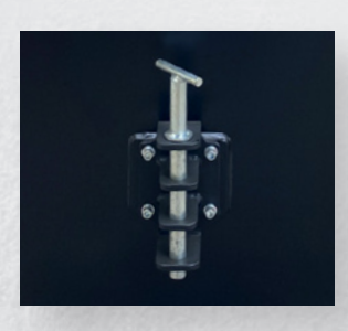
Rear Multi-Position Tow Coupling