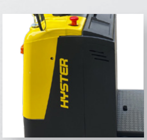
Easy Service Access