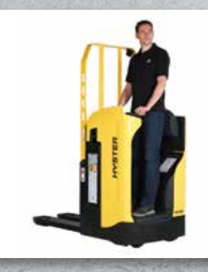
Tall operator in standing position