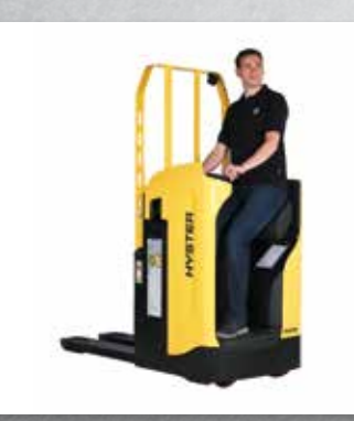
Tall operator in leaning position