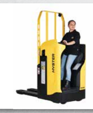
Short operator in leaning position