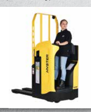
Short operator in standing position