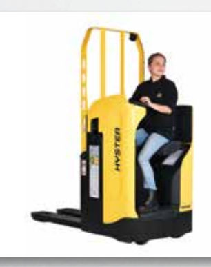
Short operator in sitting position