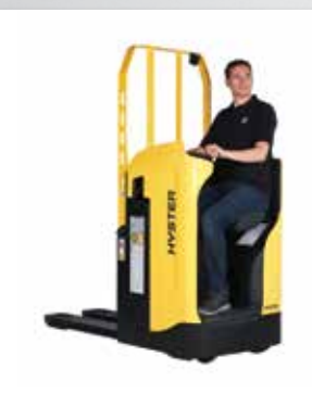
Tall operator in sitting position