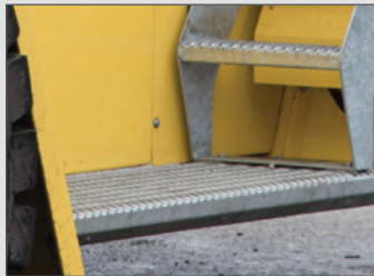
Broad, slip resistant running boards