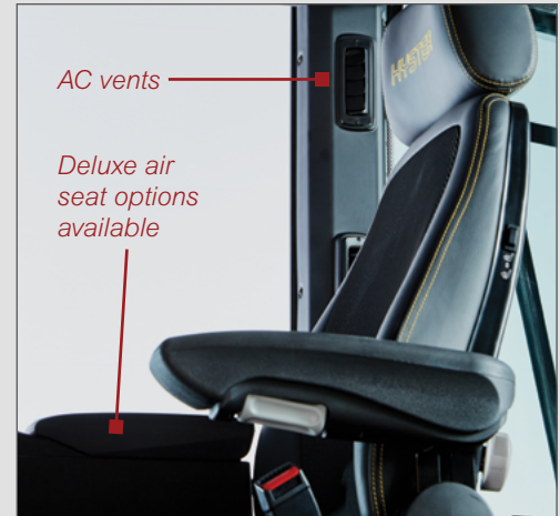
Optional seat shown.

The 7" full color, touchscreen Integrated Performance Display shows all truck activity, allows for easy access to change or calibrate truck settings and is integrated with Hyster Tracker telemetry system.