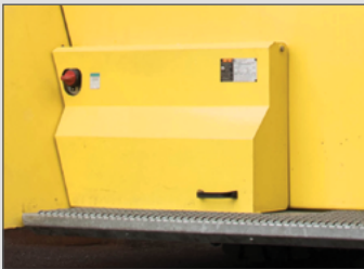
Optional utility toolbox and storage compartment