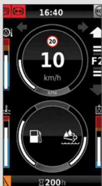
Optional secondary display available specifically for double handling.