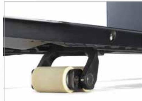
Enhanced pallet entry/exit

The Hyster® C60Z HD and C80Z HD 6,000 lb. and 8,000 lb. heavy duty center riders are extraordinarily quick. Pace-setting, programmable acceleration and travel speeds allow more loads to be moved per hour. A high-performance hydraulic system, coupled with the advanced pallet entry-exit system, produces outstanding cycle times. In addition to being quick, these trucks are exceptionally maneuverable. Their tight turning radius, short head length and control handle design allow them to easily enter and exit tight spaces quickly.