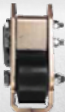
heavy duty caster