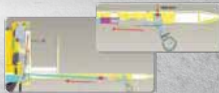
changing linkage points reduces force in system by 25%