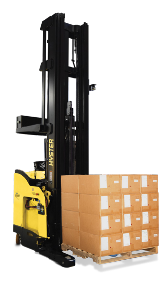
Robotic reach truck