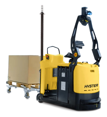
Robotic tow tractor

Pick up floor level loads and deposit them in storage locations.