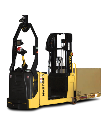
Robotic counterbalanced stacker

Collect waste throughout the shop floor, avoiding unproductive downtime between primary trips.