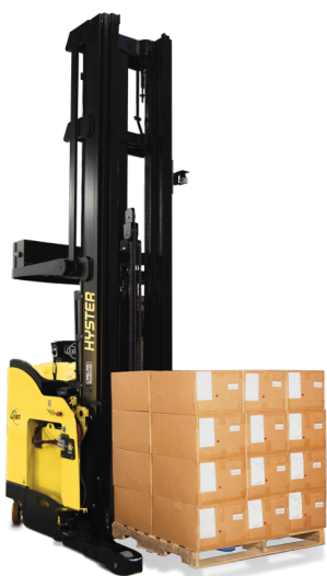
Automated reach truck

Pick up loads from elevated pallet conveyor on stretch wrapper and palletizing lines and transport to outbound staging.