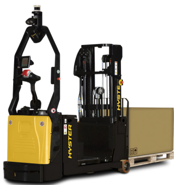
Automated counterbalanced stacker

Collect waste throughout the shop floor, avoiding unproductive downtime between primary trips.