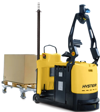
Automated tow tractor