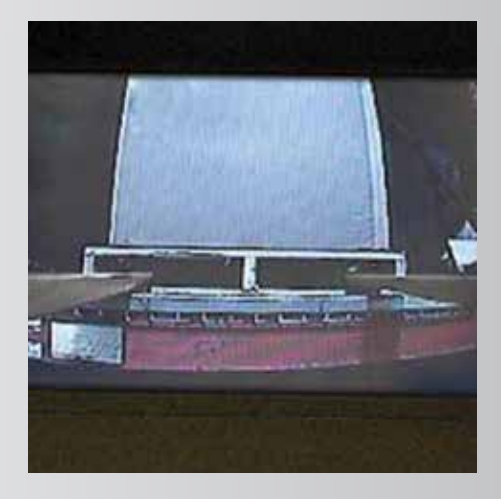
Operator's view without camera