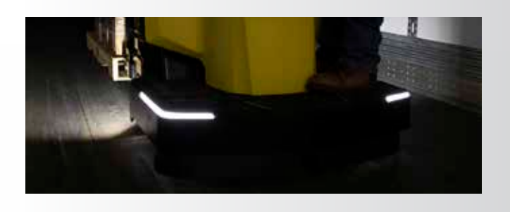
LED platform and trailer lights on the Hyster end rider.

Specific to Hyster end rider models, LED platform and trailer lights are available. Platform lights can help increase pedestrian and operator awareness of the platform perimeter in low light or congested areas. Trailer lights help improve visibility in dark trailers or aisles, aiding operators in accurately picking and placing loads in trailers.