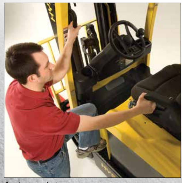
3-point entry design