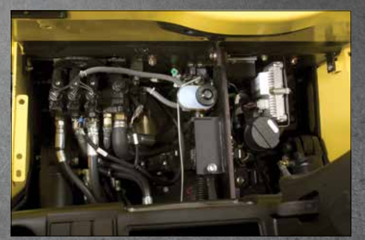
Unrestricted service access