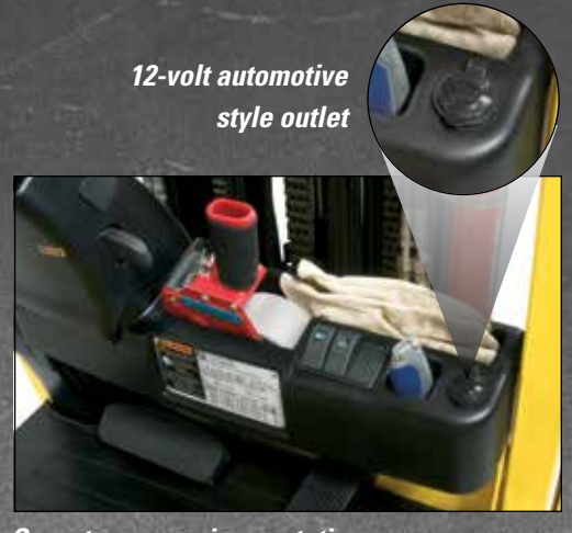
Operator convenience station