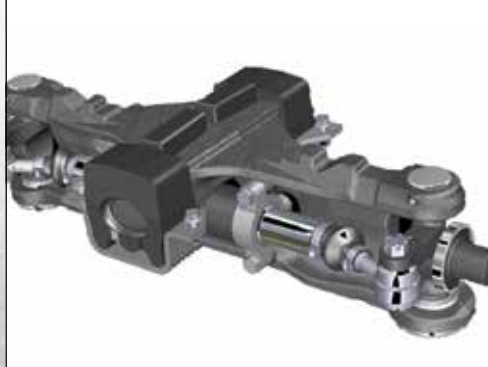
Durable steer axle