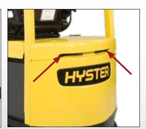
Large air inlet ports