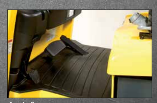
Ample floor space