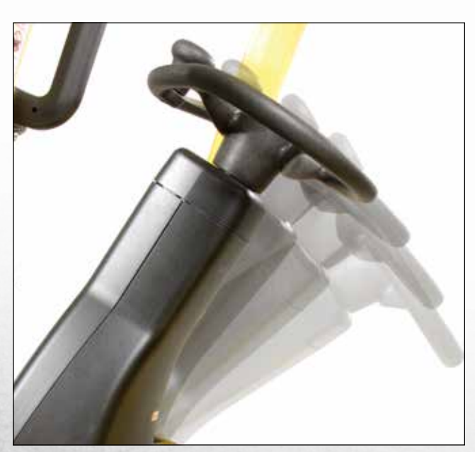
Infinitely adjustable tilt steer column