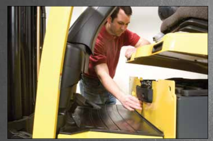
Easy battery access