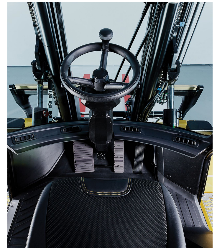
The operator has a clear view of the fork tips when in the operator seat

By integrating batteries into the existing truck design, rear visibility is the same on most equivalent ICE models. A raised hood spine is required for select models when equipped with three- or four-battery packs and forced air cooling, though effects on visibility are minimal as seen in the comparison photo.