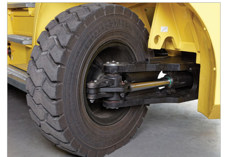
Adjustable maximum steering angle