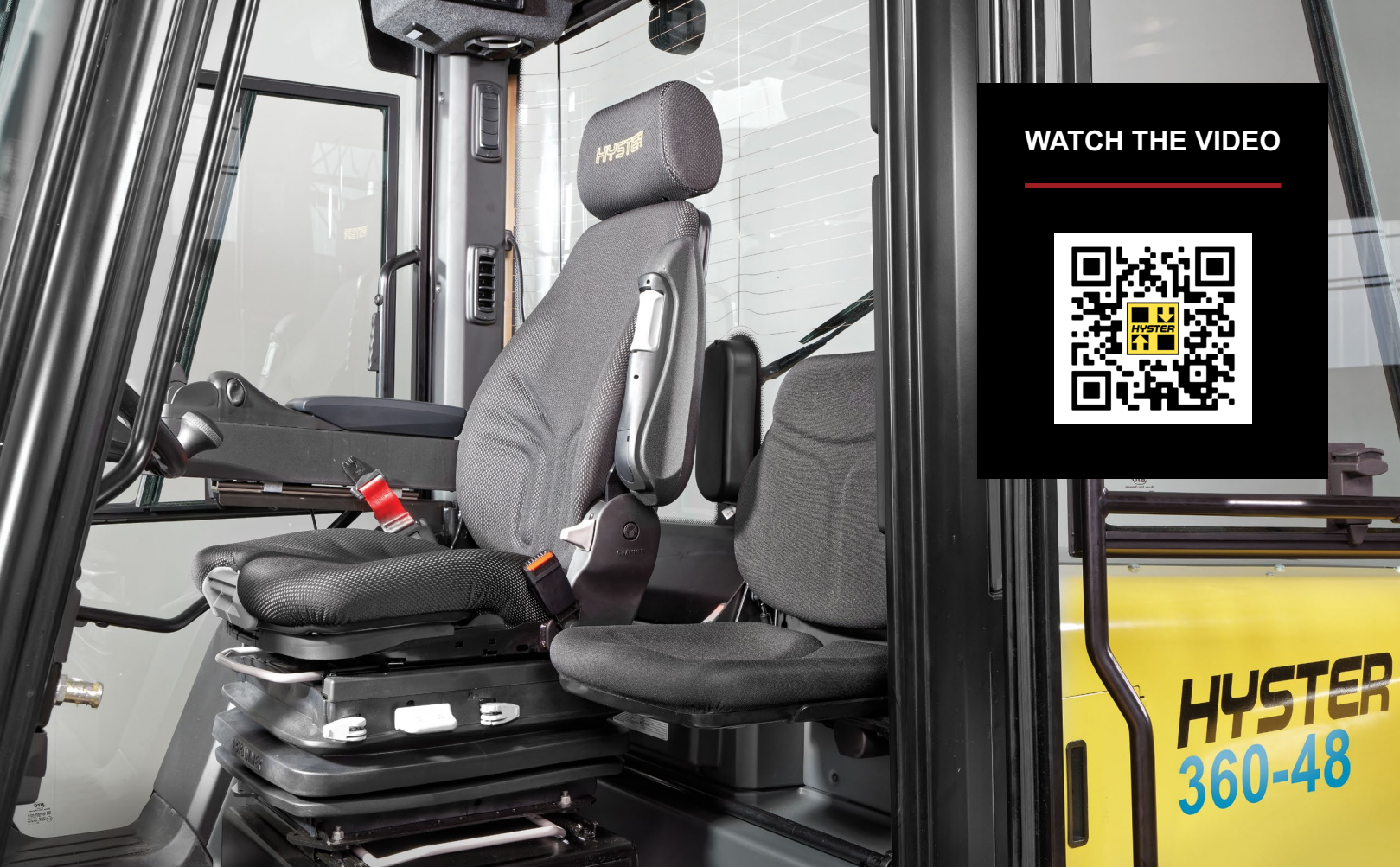
Image shows optional trainer seat