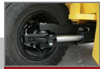
Heavy duty steer axle