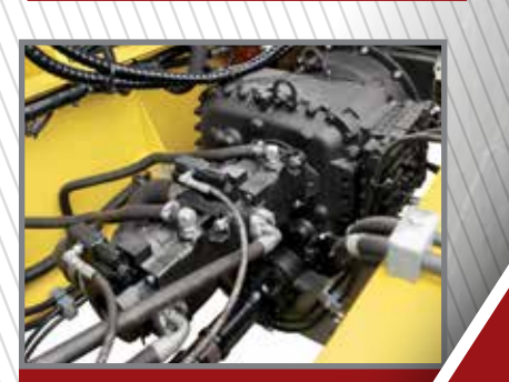
On-demand hydraulic system