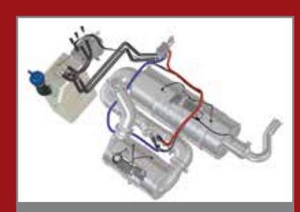
Tier 4 Final after-treatment package

Hyster understands that your total cost of ownership extends beyond the initial acquisition costs. Hyster has collaborated with leading quality suppliers to provide well-integrated systems that help reduce your overall cost of operations over the useful life of the truck.