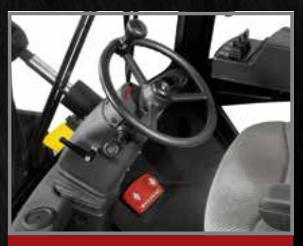
Fully adjustable steering column

A curved tempered glass windshield provides a front end view. Likewise, a curved rear windshield provides rearward visibility over the operator's left and right shoulders.