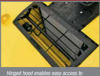
Ringed hood enables easy access to radiator cooler

Quad-core configuration enables efficient cooling