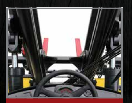
View of fork tips