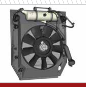
On-demand cooling reduces fuel usage