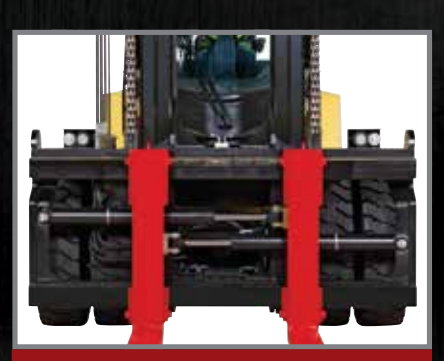
Low profile carriage for clear line of vision