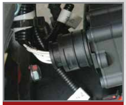
Standard profile Deutsch pin connectors, IP64 compliant

On-demand hydraulics reduces heat load into the truck by pumping oil only when needed. The drivetrain runs cooler, thereby further extending the hydraulic oil and component life.